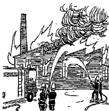
"It went up in flames before we could put it out."